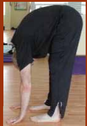
Following piriformis and calf muscle stretches